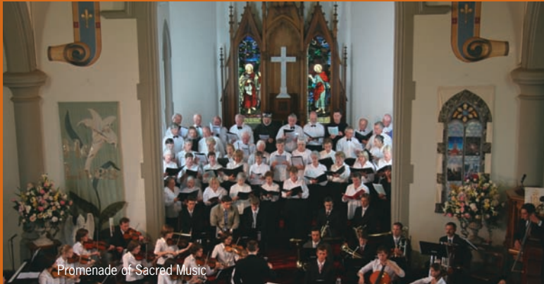
Promenade of Sacred Music