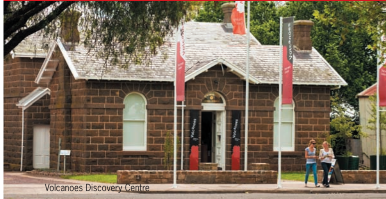
Volcanoes Discovery Centre