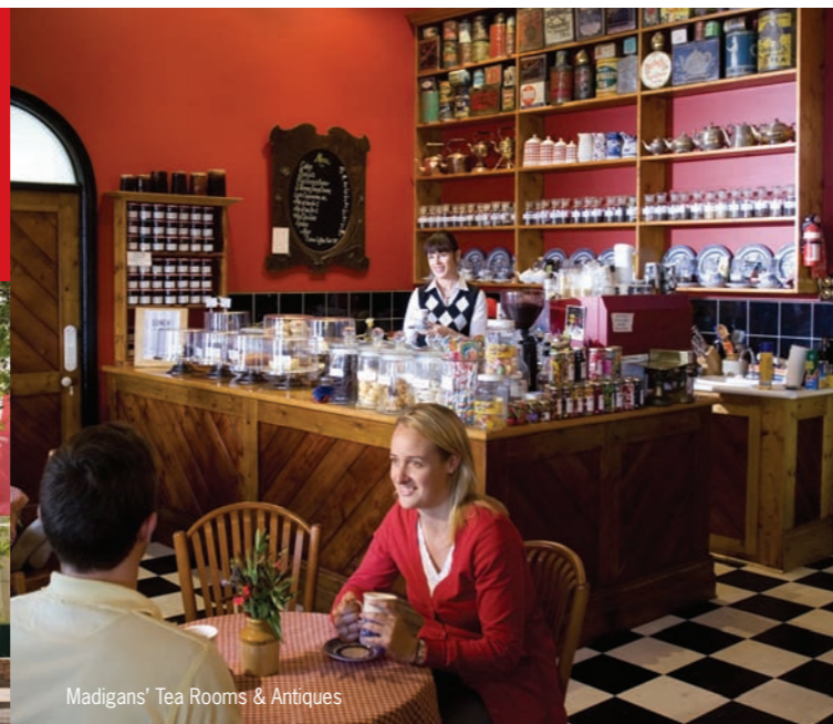
Madigans' Tea Rooms & Antiques