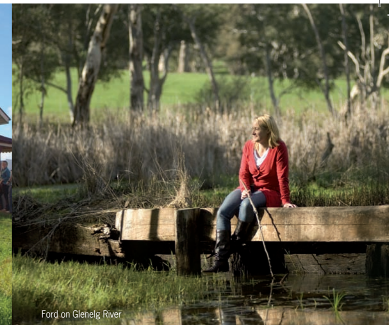
Ford on Glenelg River