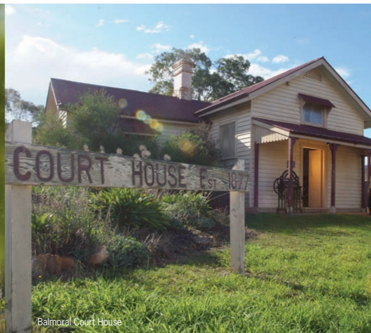
Balmoral Court House