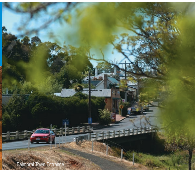
Balmoral Town Entrance